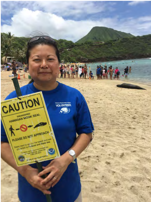
Keeping visitors away from a napping Hawaiian monk seal at Hanauma Bay Nature Preserve