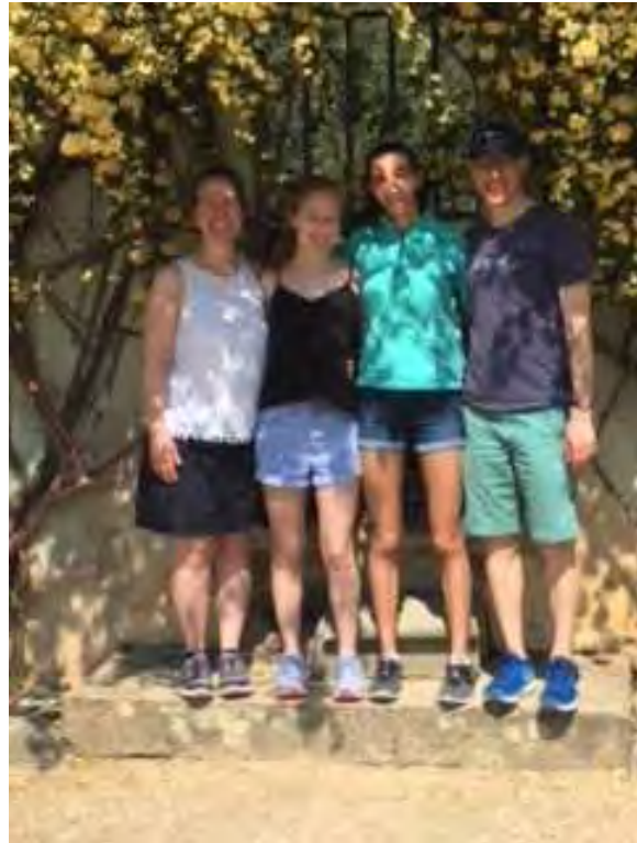
Our family trip to Italy in 2019