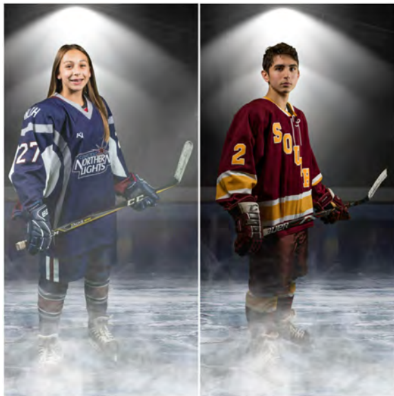
My hockey players