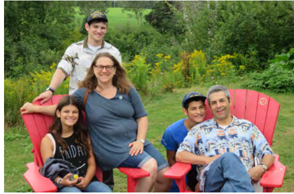
PEI's Green Gables National Site