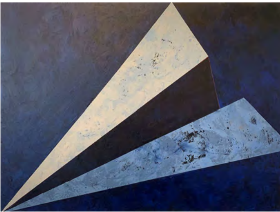
A recent painting: Flight Pattern, 30' x 40", oil and cold wax on canvas, 2019