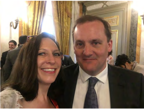
With the other half