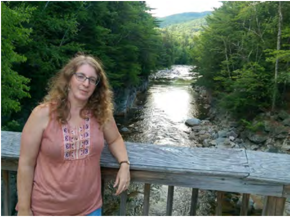
In the White Mountains of New Hampshire