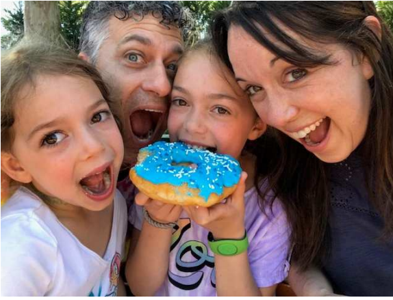
Family trip to Disney this past April