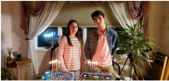
Hanukkah Dec. 2019