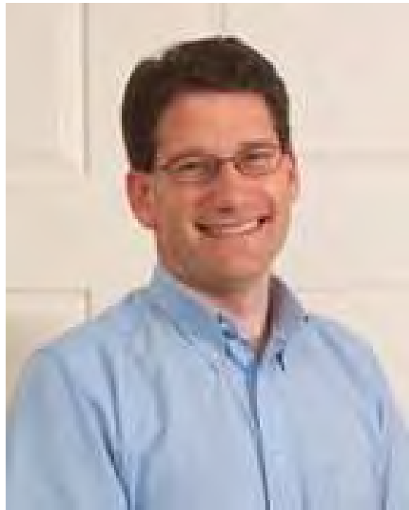
When I was a little younger...

-- As we get older, I do yearn for those more innocent days in college, but I also am truly grateful for how Brandeis nurtured me and has provided me with a large circle of lifelong friends.