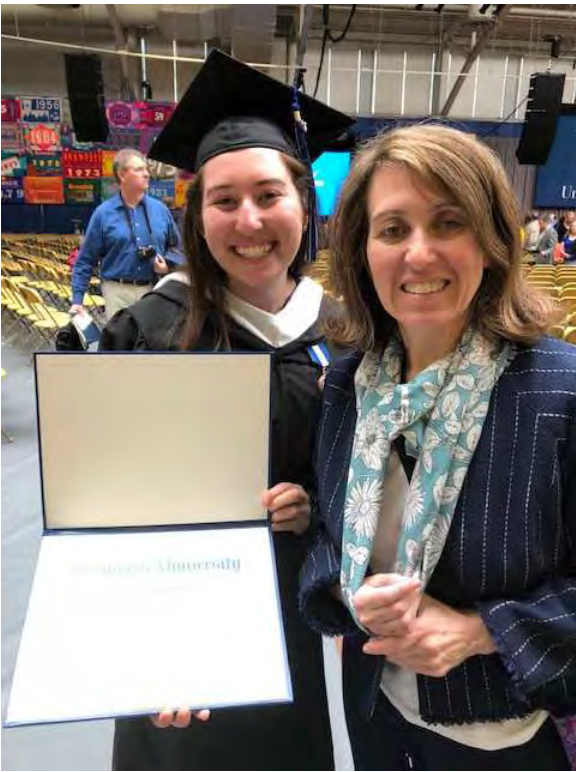
The Next Generation Brandeisian