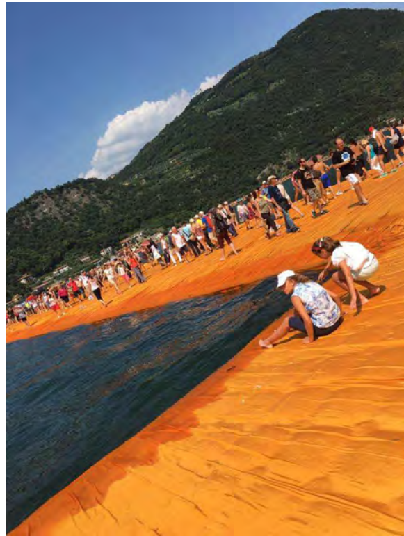
Floating Piers, Sulzano, Italy, Aug 2016