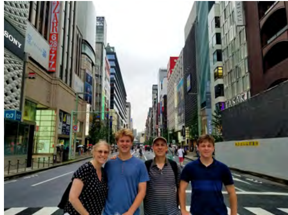
With my family back when we could travel! (Tokyo 2019)

I had been excited to return to Brandeis for our 30th reunion — I haven't been back since 2000 when I attended our 10th — so I'm disappointed in the way things have turned out. Hopefully we'll have another chance to gather in the future.