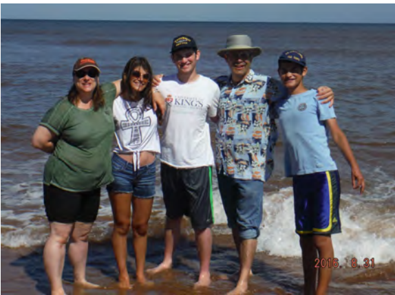
Visiting PEI with my family.