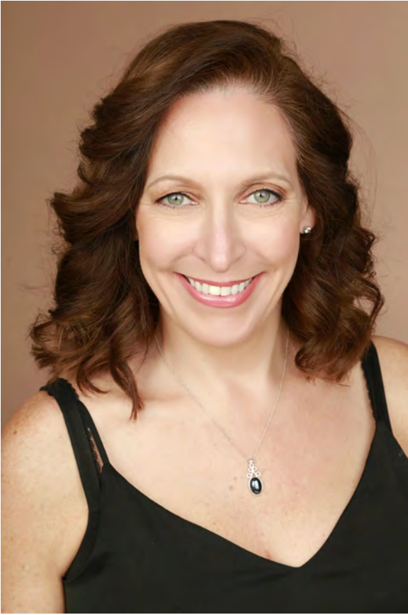
My "official" author photo.