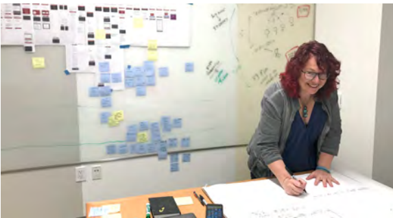
Design strategist at work