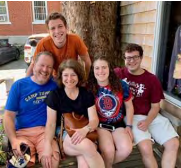
The fam on Martha's Vineyard