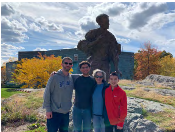
Brandeis Family Weekend 2019