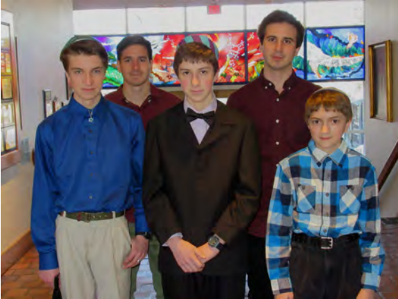
My five sons