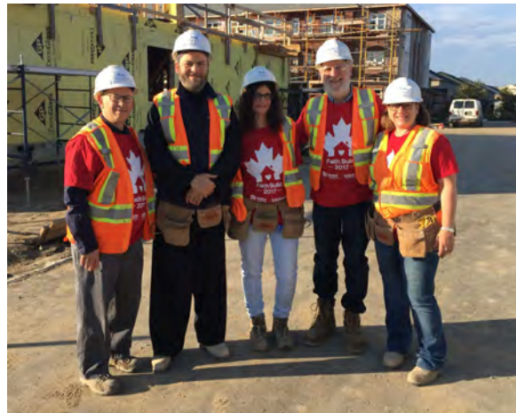
Working on a clergy build with Habitat for Humanity. (I'm on the right.)