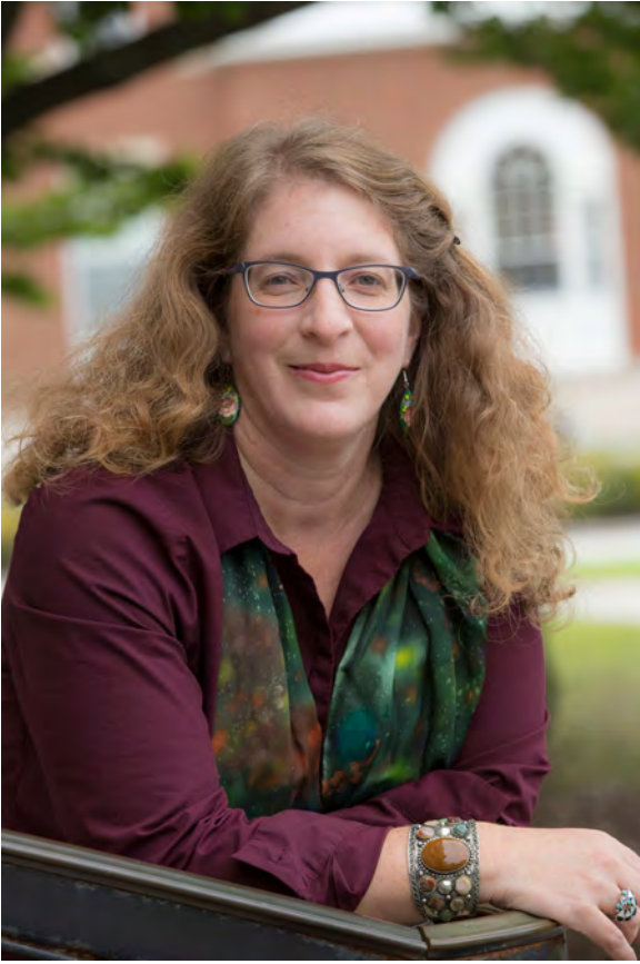
On the campus of Bowdoin College