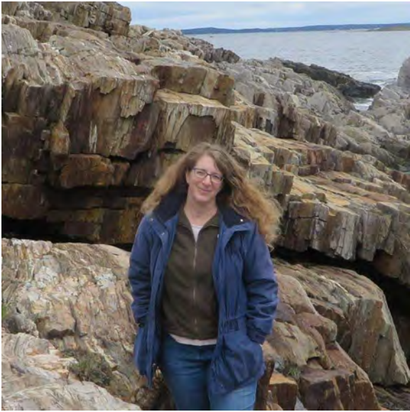
At the Giant Stairs, Harpswell, Maine