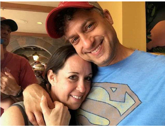
My last birthday