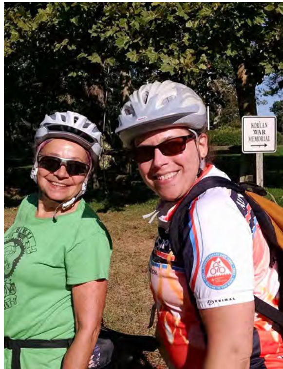
American Lung Association AEBT 160-mile Fundraising Ride, 2015