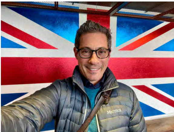
Recently at Google London