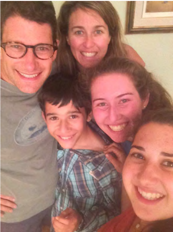
The Farbman Five