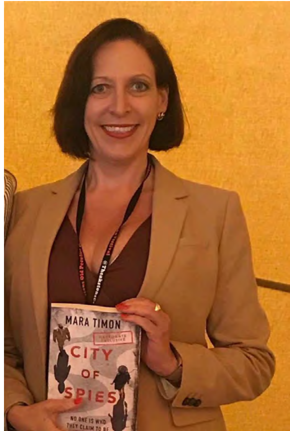
At the Harrogate Crime Festival, looking a bit shell shocked and holding a proof of my debut novel

But there was still a big thing on my bucket list. For as long as I can remember, I loved writing. Mostly, I would write for my own pleasure but dreamed of writing a novel (and getting it published). So a few years ago, I decided to make it happen. My debut, City of Spies , is an espionage thriller and will be published in September 2020. Life is good. :)