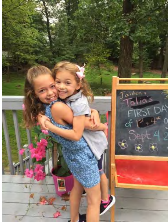
First day of school