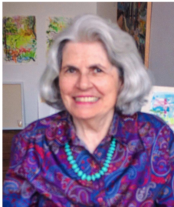
In my studio

Making people both laugh and cry through my art.