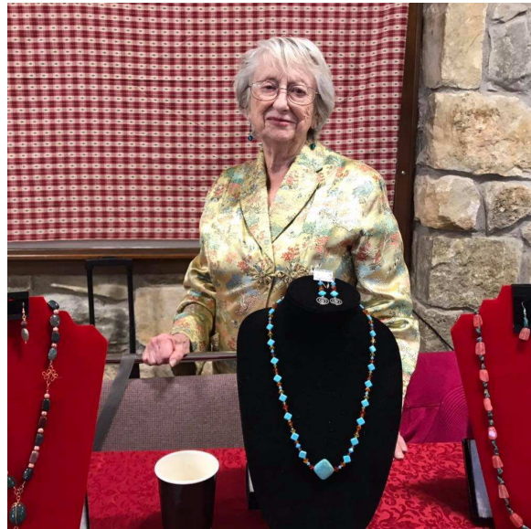
Selling my custom designed and crafted jewelry

and grandmother would have been horrified. My hope is that we can return to the ideals, morality, and truth (emet) that has characterized our country. Although we have never totally lived up to these ideals, we have fallen so far away from them that it is disheartening. I want my grandchildren to have a different world than this, a compassionate world, a generous world, a truthful world.