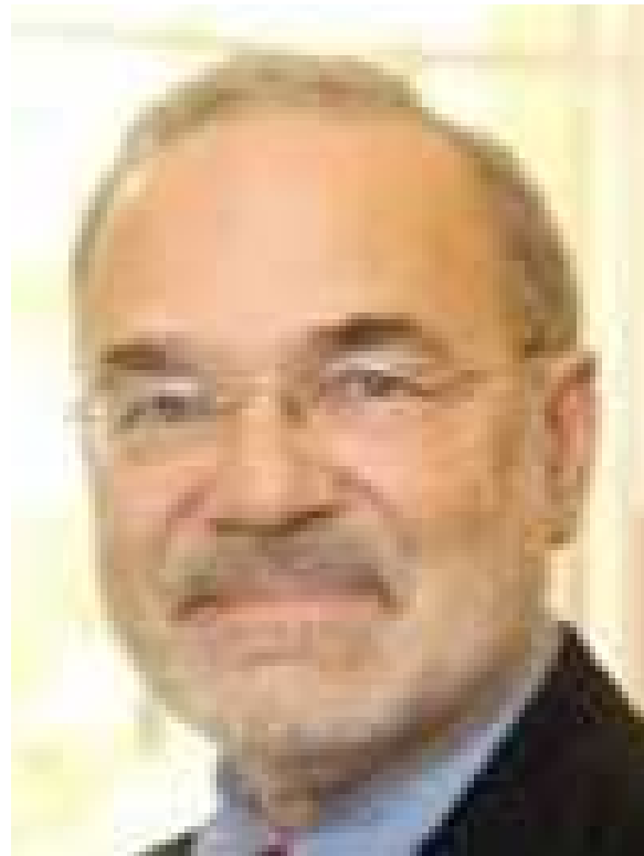
I wish I still looked like I did 20 years ago