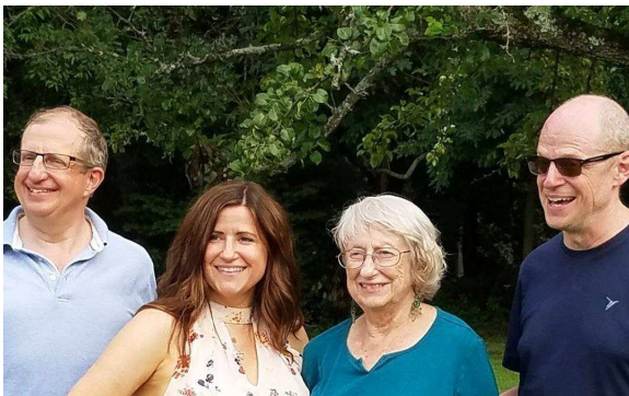
My kids and I at my 80th birthday celebration