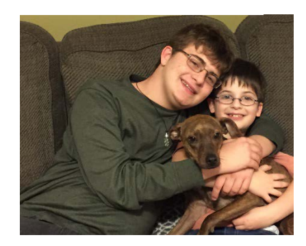
My two sons with our recent puppy, Belle