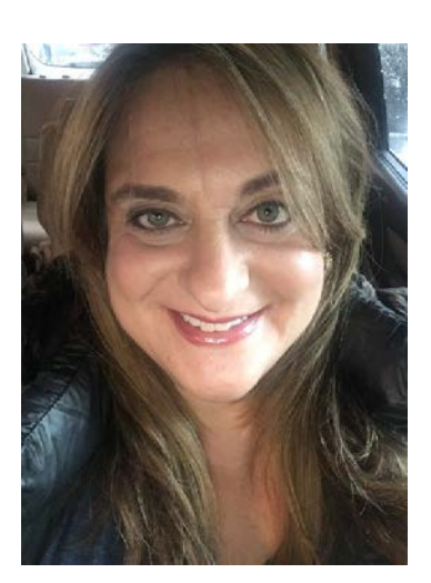
Me, selfie, 2017.

I regret not have taken what was then called European Cultural Studies courses and history courses beyond the requirement.