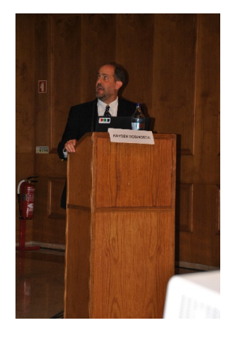
Hayden giving an invited address in Lisbon