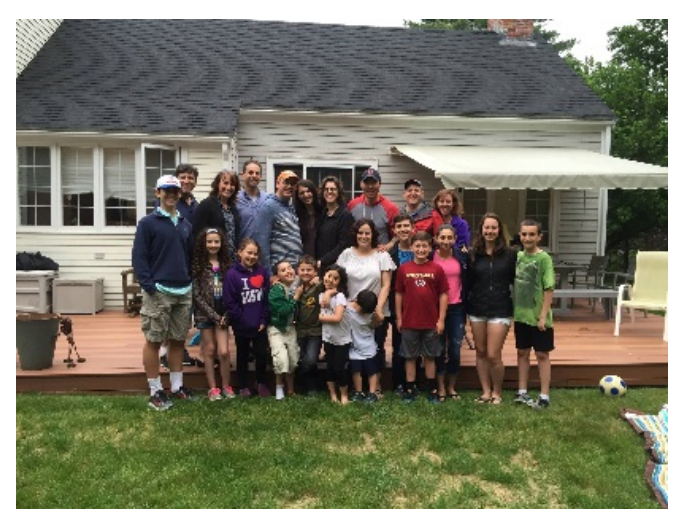
BBQ with 5 'Deis alum families