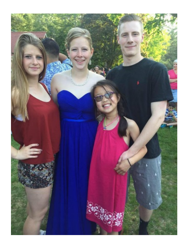
My awesome foursome