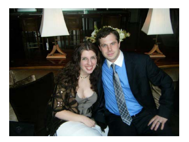
Our 5-Year Anniversary in 2014