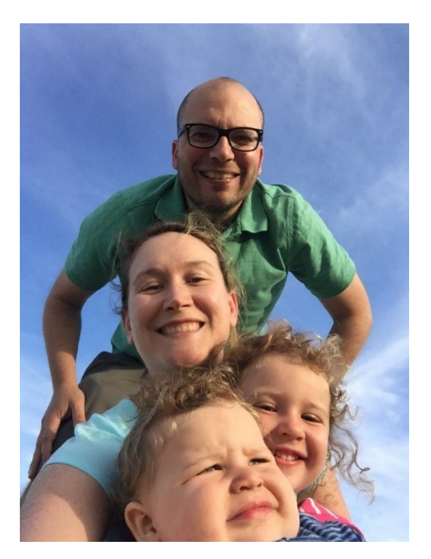
With the family at Narragansett, August 2016