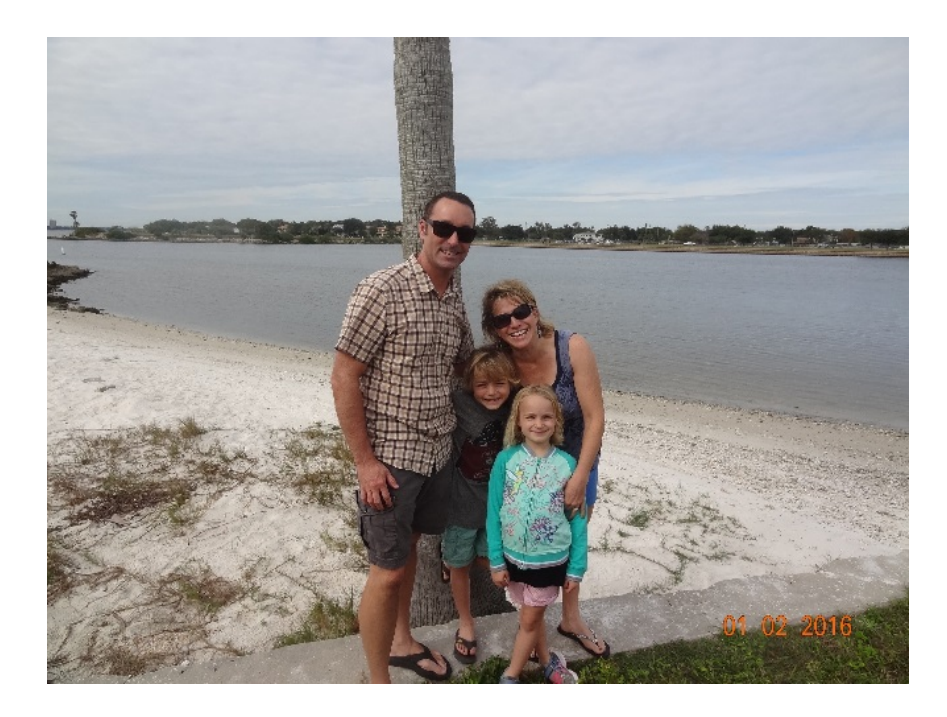
My family in Florida, December 2015