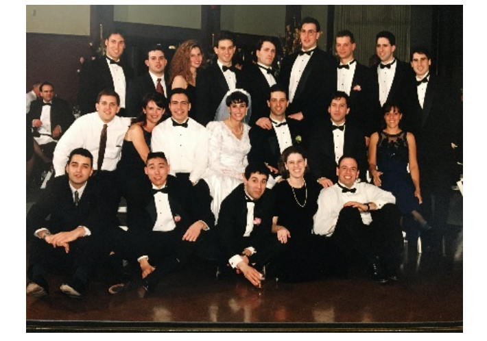
Brandeis friends attending our wedding in 1996, in Columbus, Ohio