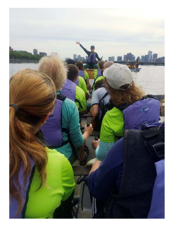
Dragon Boat races 2016 -- Drumming on the Charles River for Lesley University team

Since Brandeis graduation, I've been glad to keep in touch with a few friends, and even though life gets crazy with family and work, and time seems to tight to talk as often as I'd like, whenever we do get together it's like no time has passed at all! I'm grateful to Brandeis for providing the foundation for such special friendships!