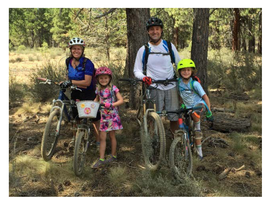
Family bike trip in Bend, Oregon, August 2016