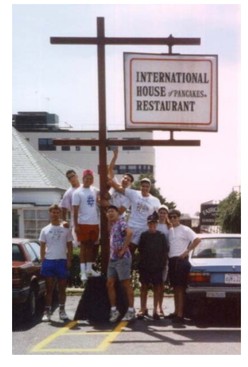
Back in '91 with the guys