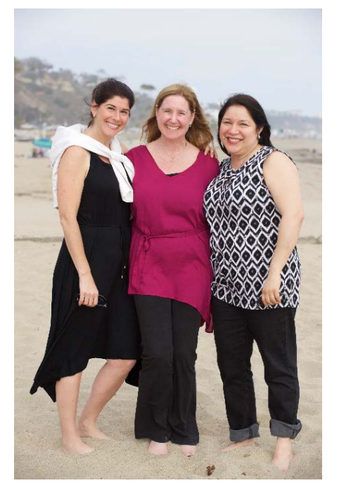
"A friend is someone who knows the song in your heart, and can sing it back to you when you have forgotten the words"