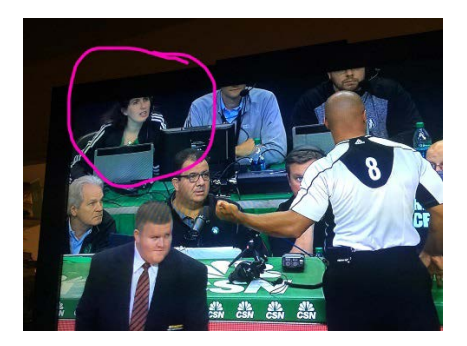
As seen on TV (working a recent Celtics game)