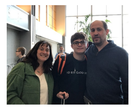
My 14 year old leaving for Italy with his 8th grade class

Take an economic course - they seemed to hard, but more commonly I have to deal with health issues around cost and return on investment