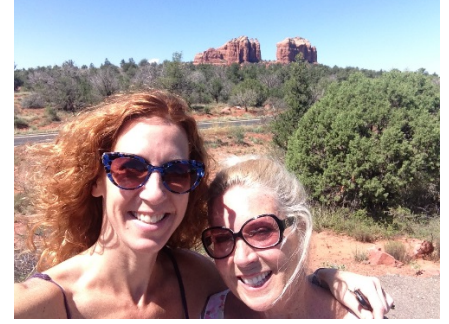
Mom and I in Sedona