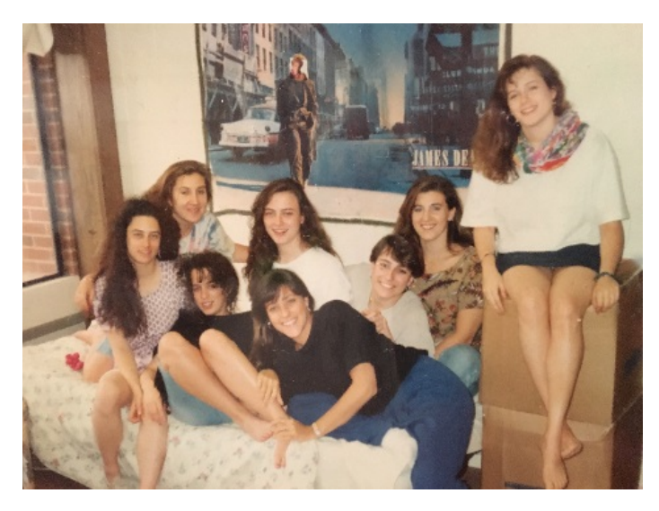
Rosenthal East Suite 210, Sophomore Year '89-'90