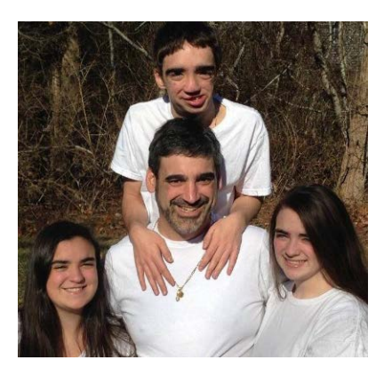
Me with my kids in 2015