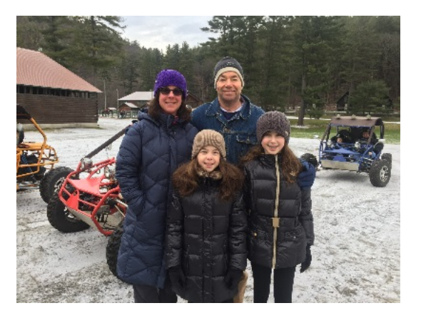
2016 Lake George fun with family