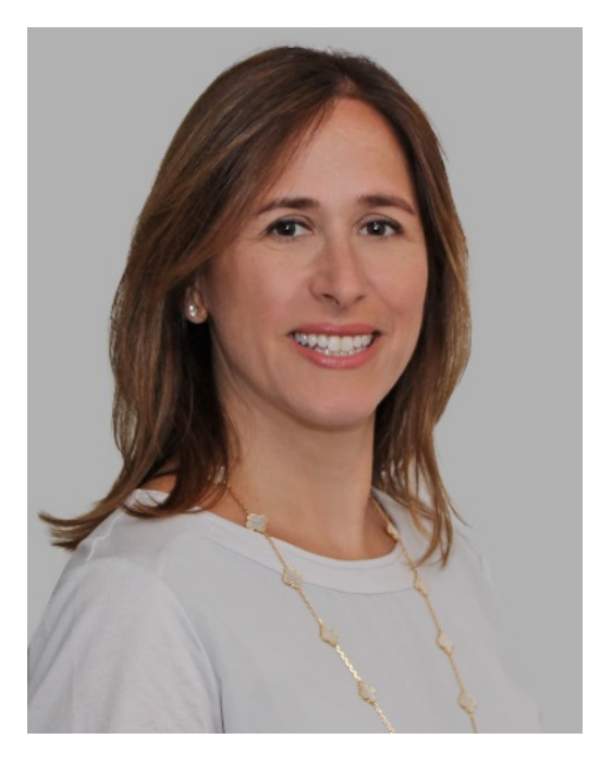
Me in 2017

I have been in-house counsel for over 20 years, specializing in real estate matters.