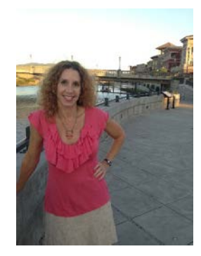
Evening in Napa