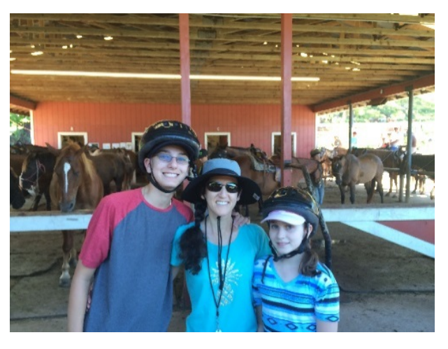
Horseback ride w/ the kiddos in Hawaii -- Summer 2016