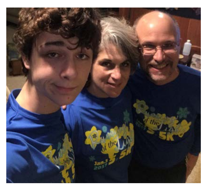
Family 5k at midnight on New Years' Eve