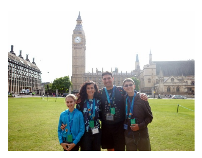
Visiting London in Summer 2015