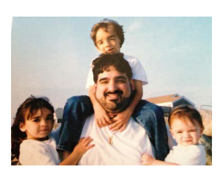
Me with my kids in 2002