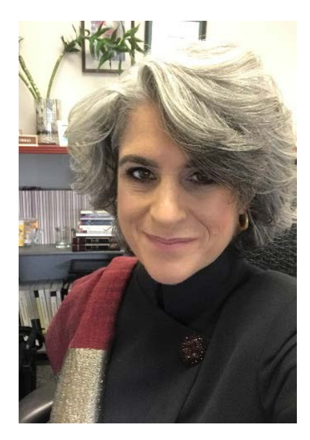
Divorce lawyer by day.

Emory Law, JD 1994; Fellow of the American Academy of Matrimonial Lawyers and International Academy of Family Lawyers; certified by the Supreme Court of New Jersey as a Matrimonial Law attorney. Frequent speaker and author of continuing legal education programs.