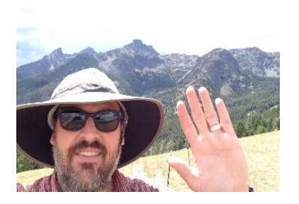
Me at Seven Devils Mtns, Idaho, USA.