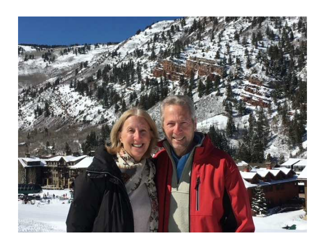
Still college sweethearts!

Lastly, I became a potter at the Pot Shop at Brandeis. Still a lifelong interest that was put on hold for much of my adult life, I did re-engage with potting when I retired. We live in Sarasota, FL and spend summers in Lambertville, NJ. If any classmates are nearby (or not), reconnecting would be a joy!