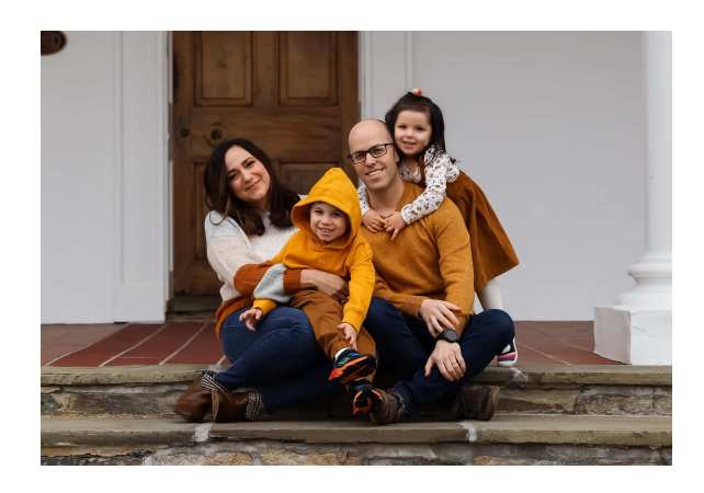
My son, daughter-in-law, and grandchildren