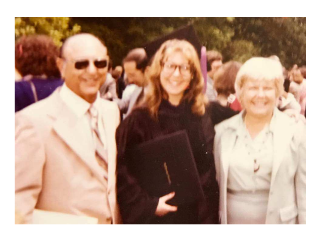
Graduation.... all those years ago...