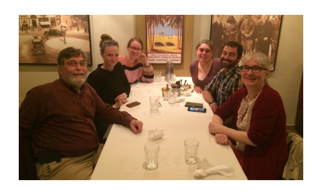
All 6 of use in Israel two years ago