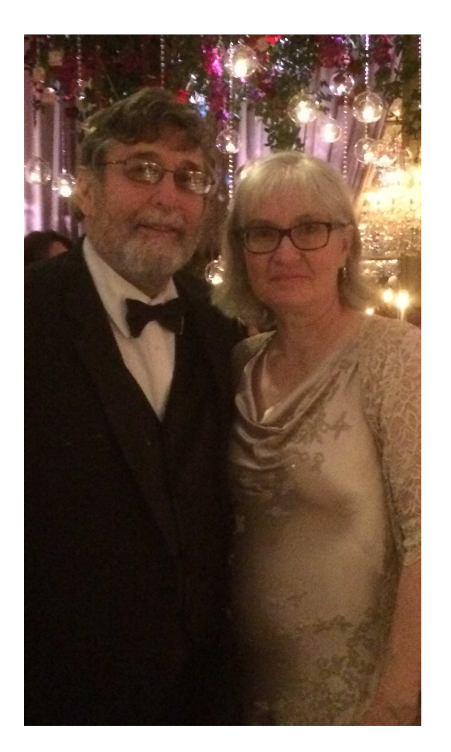
At a pre-pandemic wedding