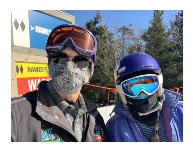
Skiing with COVID protocols