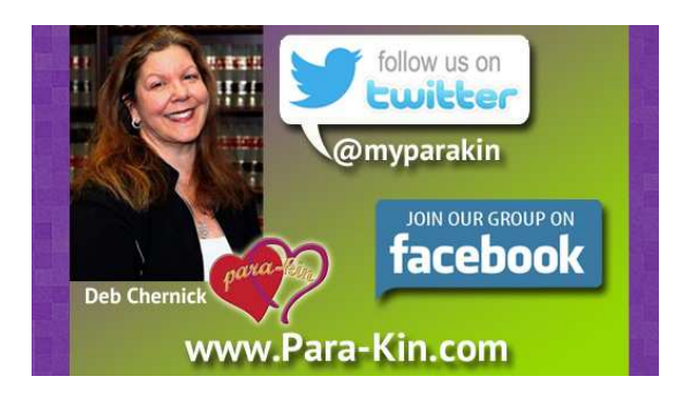
check out new terms for modern family Para-kin.com

For my law practice, whether it's purchasing a home, the birth of a child, divorce or death of a parent, all these events signal the need for legal help. For well over three decades, I have aided families going through their individual joys and sorrows. Being on Main Street as General Counsel to SRT has provided the support to offer services well beyond a Real Estate closing, the preparation of Wills and Powers of Attorneys, or a Family Court Issue. My office is truly a fixture of the Wakefield community and my Brandeis Bachelors of Arts diploma hangs proudly on my conference wall.