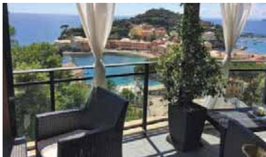
View from Hotel Vis à Vis