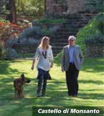
Castello di Monsanto