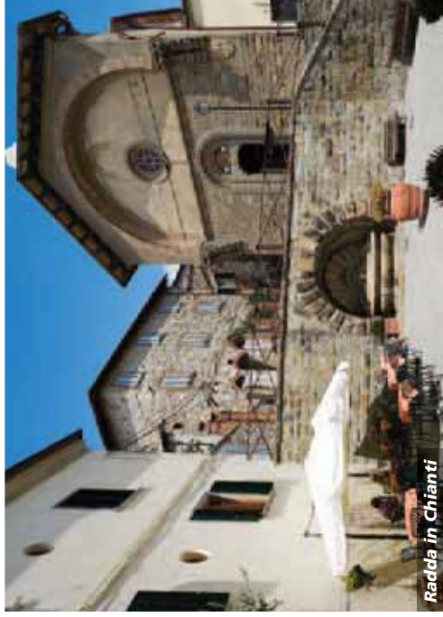
Radde in Chianti