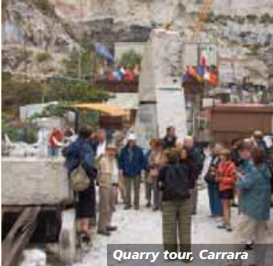
Quarry tour, Carrara