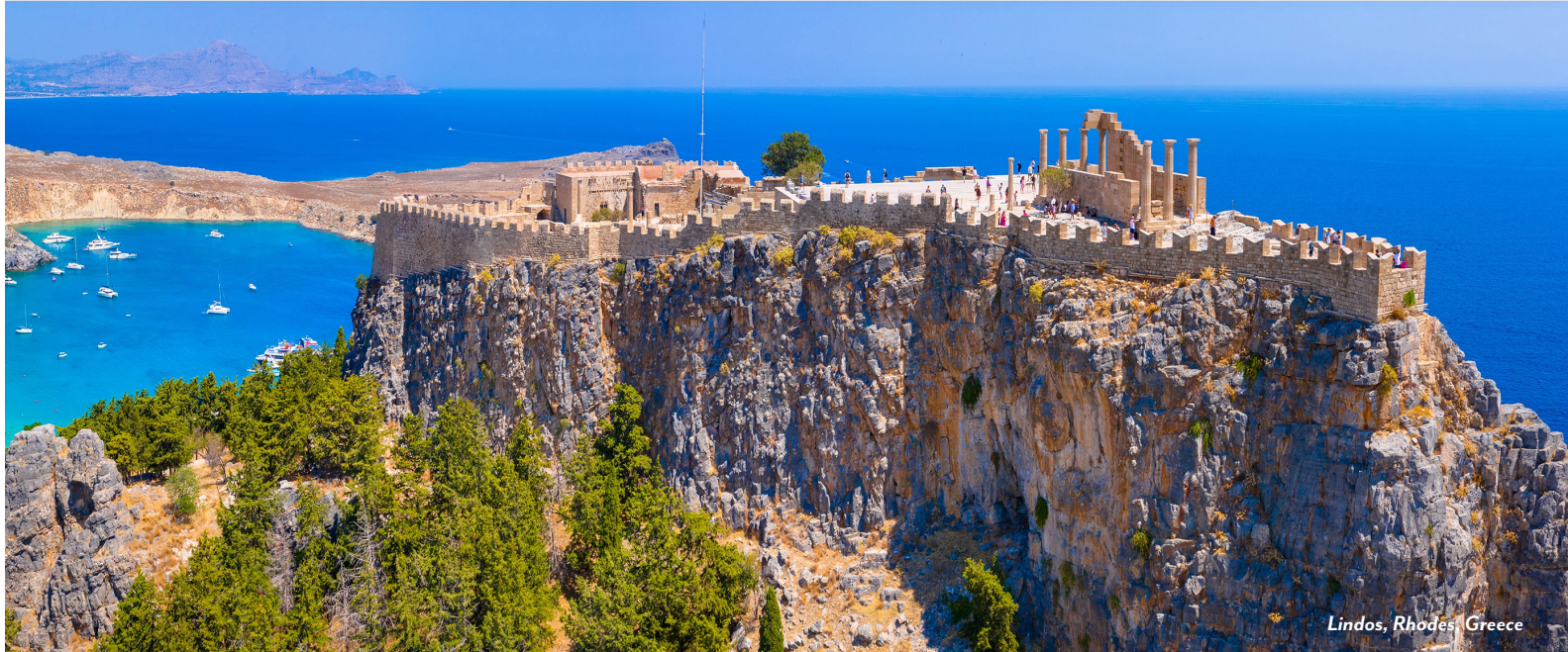
Lindos, Rhodes, Greece