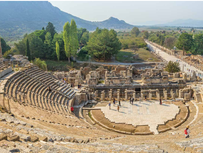
Great Theater, Ephesus, Turkey

Be on deck as your ship glides to breathtaking Santorini, one of the most iconic islands in the Aegean Sea. You'll be greeted by stunning whitewashed buildings perched above the sea and a caldera rising dramatically from the water. Some believe this location was the inspiration for the legendary lost city of Atlantis. From the port, drive to the southern end of the island to explore the prehistoric settlement of Akrotiri. Tour these