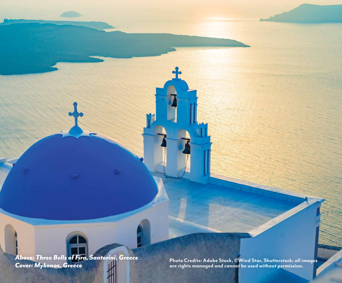
Above: Three Bells of Fira, Santorini, Greece Cover: Mykonos, Greece

Photo Credits: Adobe Stock, ©Wind Star, Shutterstock; all images are rights managed and cannot be used without permission.