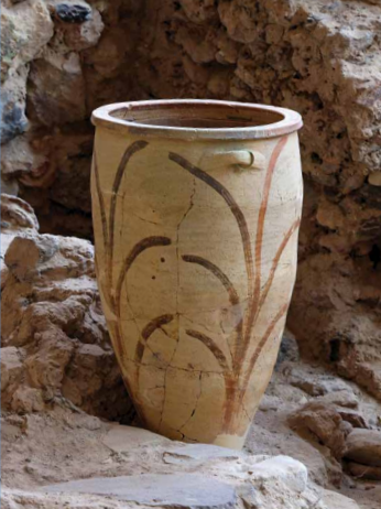
Akrotiri excavation site, Santorini, Greece

spectacular Minoan ruins, held intact by layers of pumice and ash for over 3,500 years.