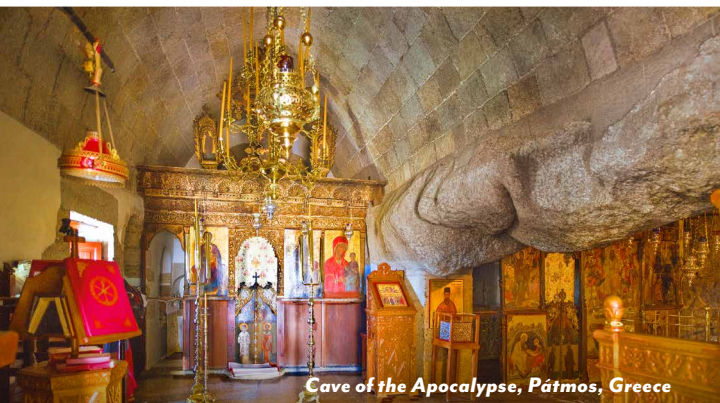
Cave of the Apocalypse, Pátmos, Greece