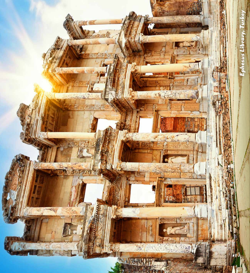
Ephesus Library, Turkey

PRSRT STD U.S. Postage PAID Gohagan & Company