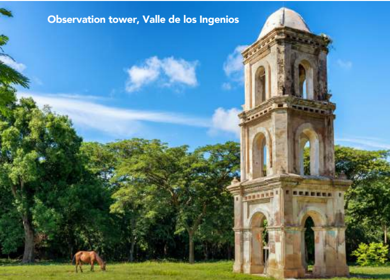
Observation tower, Valle de los Ingenios

Enjoy meeting local artisans and learning about their artwork. Visit a women-led textile workshop to observe how traditional looms are used to produce elaborate handwoven designs.