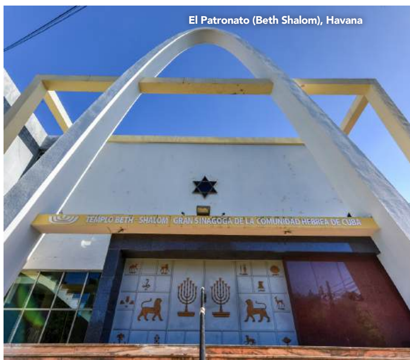
El Patronato (Beth Shalom), Havana