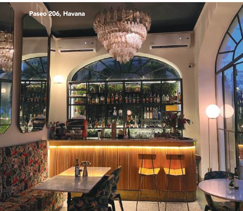
Paseo 206, Havana

DISCLAIMER: The itinerary is subject to change at the discretion of Brandeis Travel and Arrangements Abroad. For complete details, please carefully read the terms and conditions at www.arrangementsabroad.com/terms .