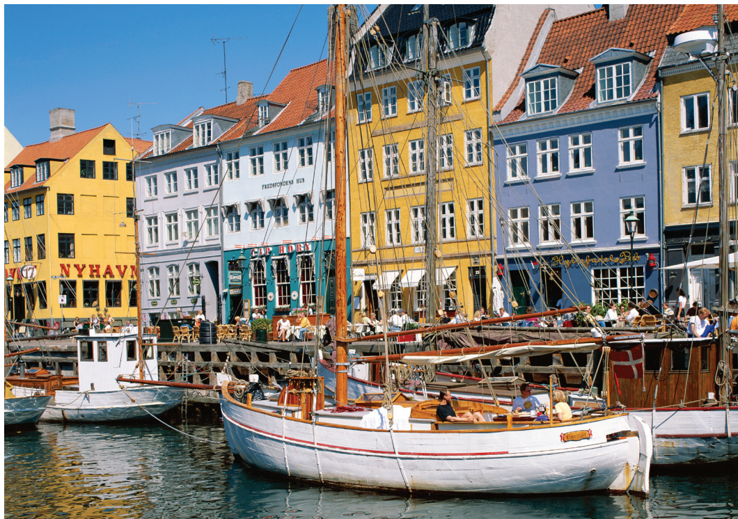
Copenhagen's lively Nyhavn waterfront area

Day 7: Gaala/Geiranger A day of beautiful scenery is in store as we travel from Gaala to Geiranger, en route negotiating hairpin bends to the summit of Mount Dalsnibba (alt. 4,900 feet) for stunning views of Geirangerfjord and the mountains, lakes, and waterfalls beyond. We reach the popular village of Geiranger mid-afternoon and get our first up-close look at Norway's most dramatic fjord. A UNESCO site, it measures 15 miles long and 960 feet deep. B,D