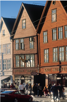
Bergen’s Bryggen district

Day 14: Oslo This morning we visit the Museum of Cultural History, Norway’s largest collection of cultural artifacts, featuring fascinating Viking Age exhibitions, as well as Egyptian mummies and several ethnographic displays. We also tour the nearby Kon-Tiki Museum, with the original vessels and artifacts from Thor Hyerdahl’s 1947 voyage across the Pacific. This afternoon is free for independent exploration. B