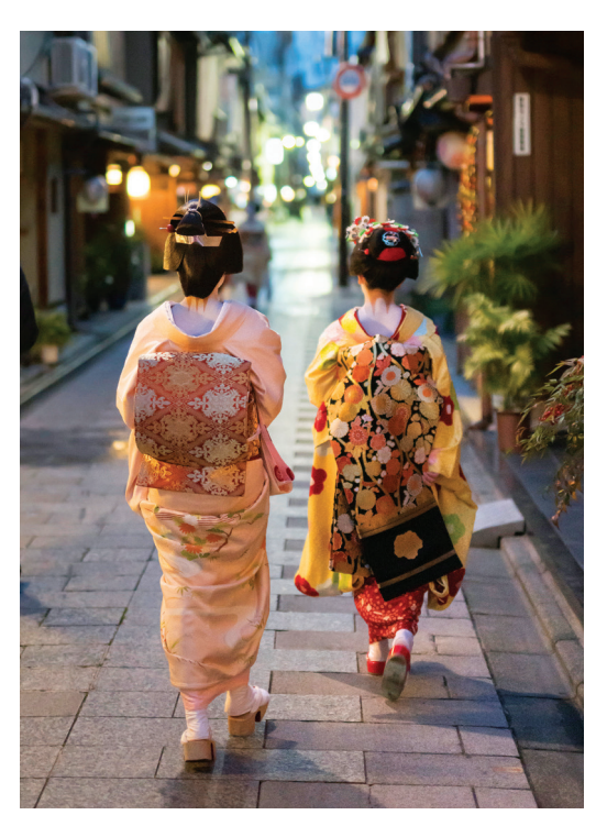
Geishas in traditional dress

Day 11: Kyoto More of Kyoto is on tap today, beginning with a visit to the otherworldly Arashiyama Bamboo Grove; the Kyoto Museum of Traditional Crafts (Fureaikan), showcasing all of Kyoto's 74 different métiers in one place; and Nijo-jo Castle (c. 1603), the extravagant residence and fortifications of the shoguns who ruled Japan for more than 250 years. Dinner tonight is on our own in this traditional, yet modern city. B