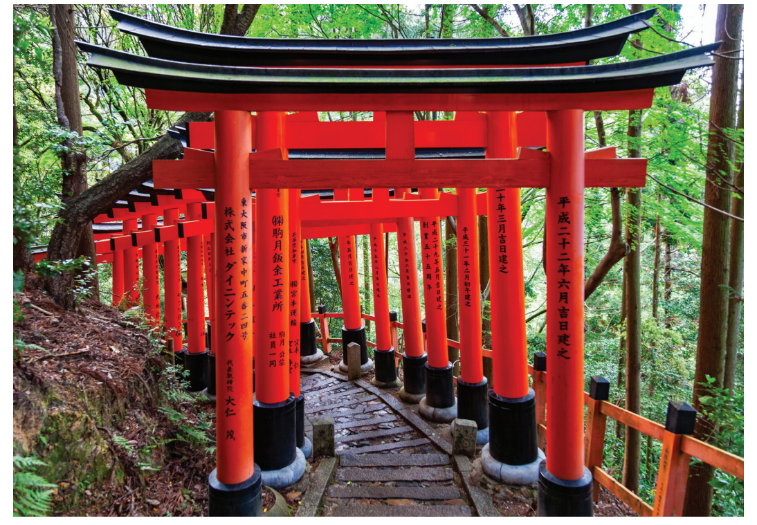
We visit Kyoto's Fushimi Inari shrine on Day 12.

Day 6: Hakone/Takayama Today we travel first by bullet train then by Wide View Hida express train to lovely Takayama in the Japanese Alps, considered one of the country's most attractive towns with its beautifully preserved Old Town. Our explorations center on three narrow streets in the San-machi-suji district where, in feudal times, merchants lived amidst the authentically preserved small inns, teahouses, and sake breweries. This afternoon we attend a traditional Japanese tea ceremony here, an historic ritual of form, grace, and spirituality. B,D