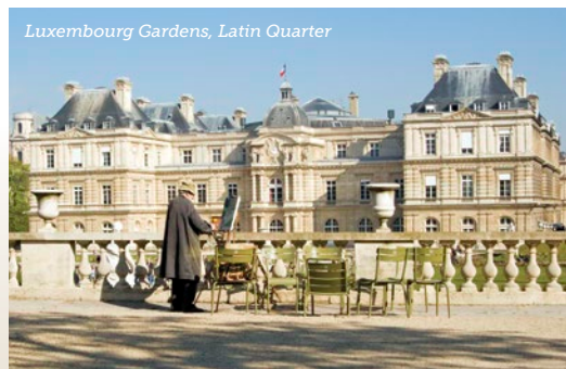
Luxembourg Gardens, Latin Quarter