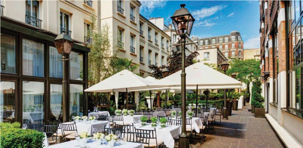
Les Jardins du Marais | Paris