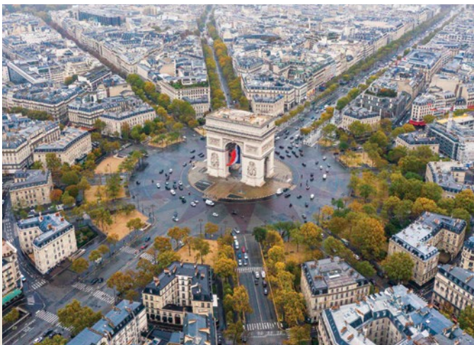
Arc de Triomphe and the Champs-Élysées

After World War I, Parisians rebuilt their lives as jazz, a new sound introduced to France by African American soldiers, filled the air. Lively and unique, jazz was the perfect soundtrack to a fresh start, both for French music fans and African American troops. The 369th Infantry Regiment is credited with transforming Paris' cultural scene. The unit became famous for its bravery and its band, led by Lieutenant James Reese Europe and Sergeant Noble Sissle. Attached to the French army because U.S. forces were still segregated, the 369th Infantry was brave in battle. Nicknamed the "Harlem Hellfighters" by the Germans, the 369th and several individual soldiers were singled out for France's highest award for valor. Off the battlefield, the band boosted morale across France with music that would soon fill Parisian clubs. For two decades, Montmartre hosted the flourishing jazz community, which drew African American musicians and club owners from the U.S. Several musicians left Paris during Germany's World War II occupation, but the city's love of jazz never wavered. Jazz surged again after the war with great African American musicians leading the way, and the music still delights concertgoers today.