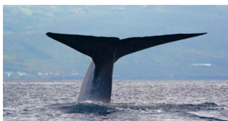
Top: Sete Cidades | Above: Whale watching in the Azores