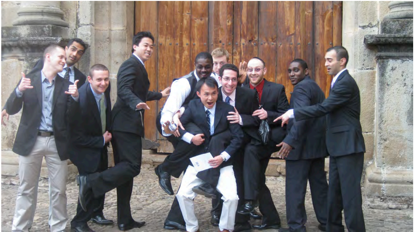
Guatemala: March, 2011