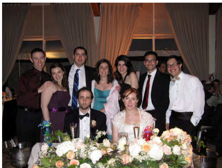
Brandeis Alum pic at my wedding in June 2010