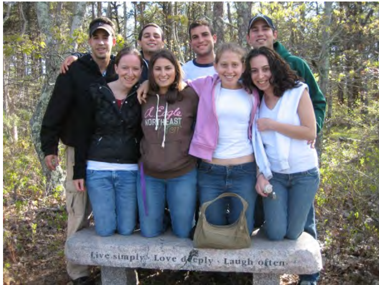
The Original Catskills photo