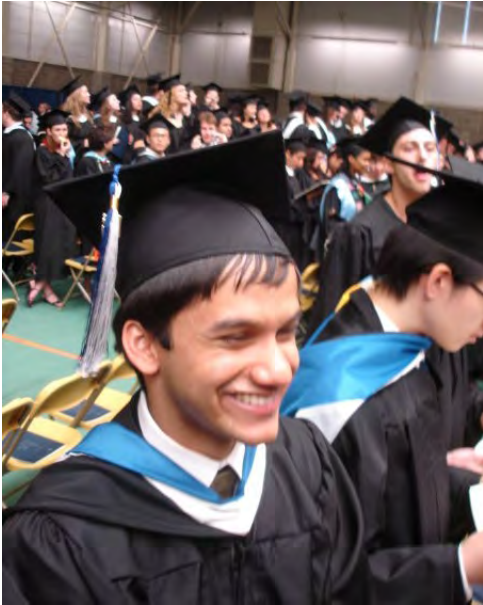
Brandeis Commencement, Waltham, MA (5/21/2006)