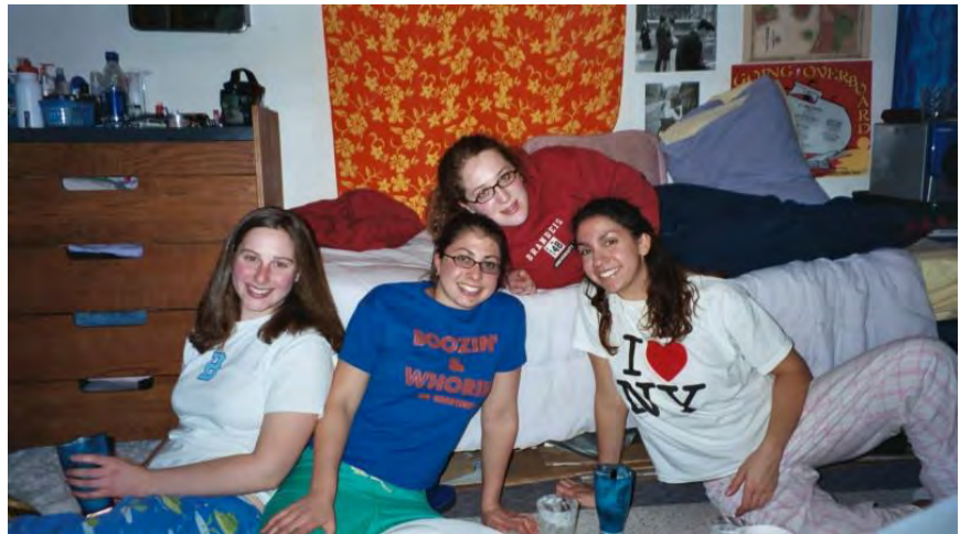
In Hassenfeld, sophomore year (winter 03-04)