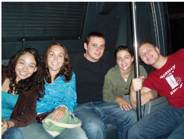
On the Brandeis Boston Bus...