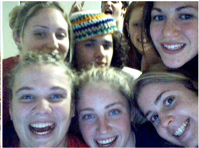
Some of the Scheffres gang, Fall 2002 (freshman year!)