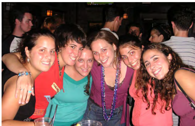
Ladies of our Mod, Fall 2005