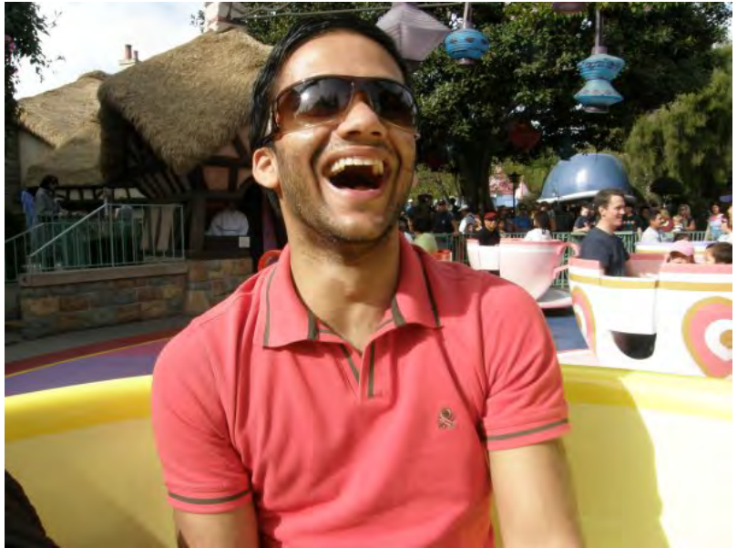
Mad Tea Party @ Disneyland, Anaheim, CA (11/27/2009)