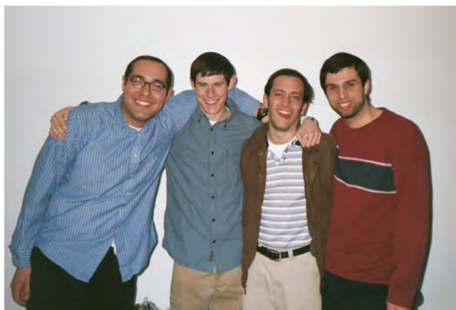
My best friends