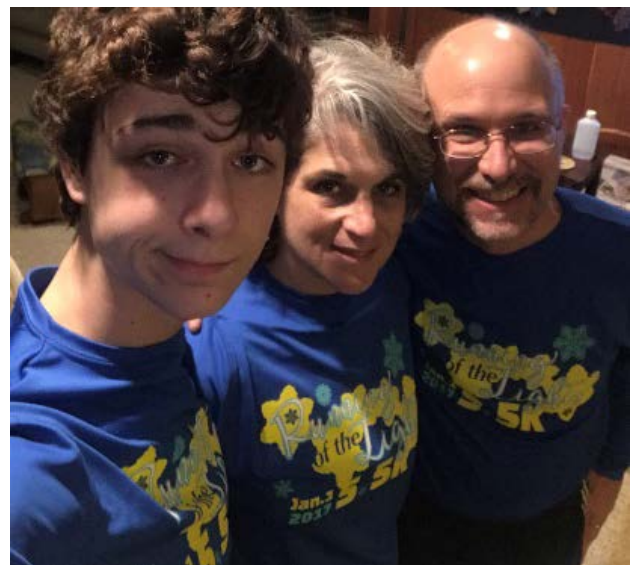
Family 5k at midnight on New Years' Eve