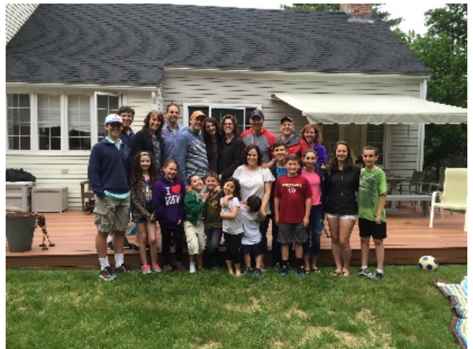
BBQ with 5 'Deis alum families