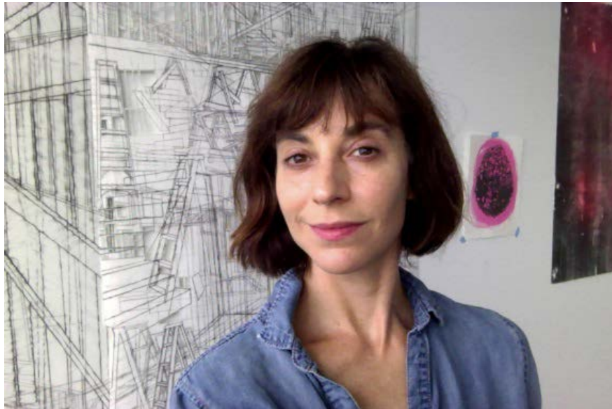
In my studio in Pittsburgh

Study literature and take a fiction writing class.