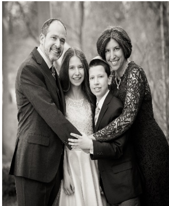
At our daughter's Bat Mitzvah