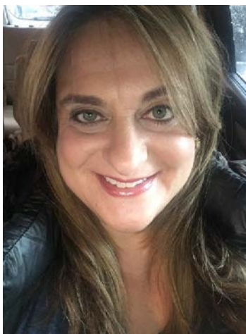
Me, selfie, 2017.

I regret not have taken what was then called European Cultural Studies courses and history courses beyond the requirement.