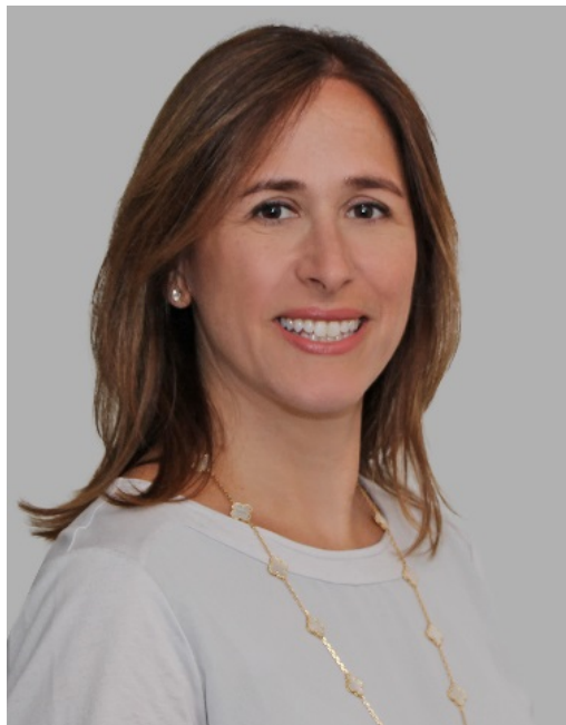
Me in 2017

I have been in-house counsel for over 20 years, specializing in real estate matters.