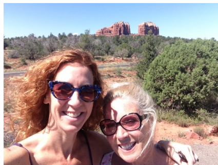
Mom and I in Sedona