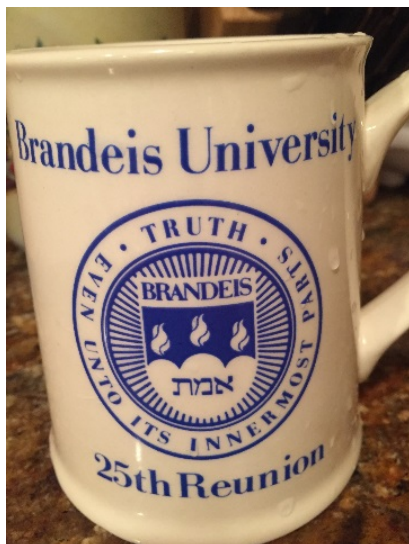
25 year reunion cup...obtained 25 years ago while at Brandeis

I never took any American Studies classes which I heard everybody loved