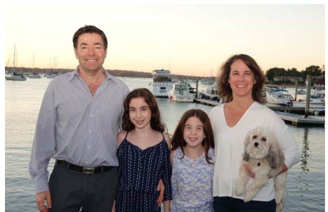
2016 Family in Northport NY