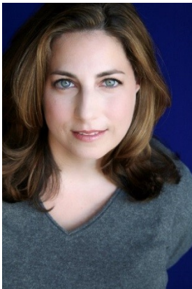
This is me!

More info on me can be found at www.staceyballis.com and at blog.polymathchronicles.net , and you can follow me on Twitter @StaceyBallis, Pinterest @StaceyBallis and on Facebook at www.facebook.com/staceyballis1