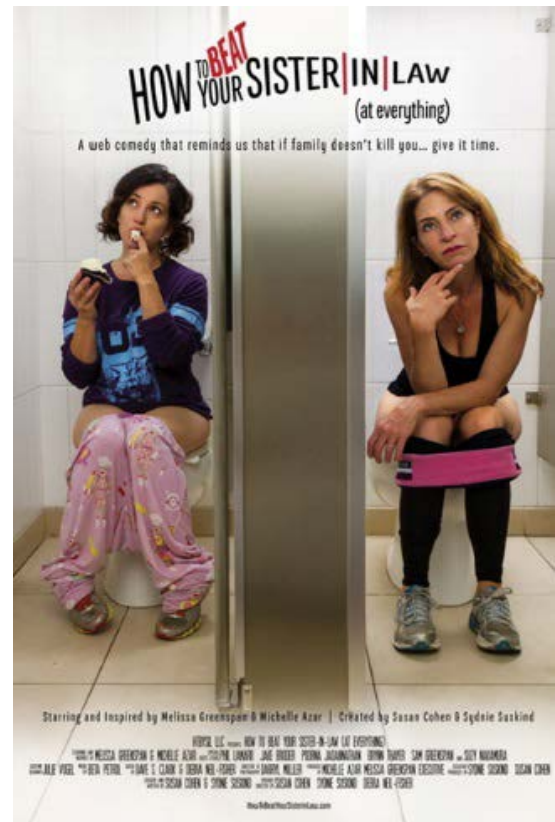
How To Beat Your Sister-in-Law Web Series Poster