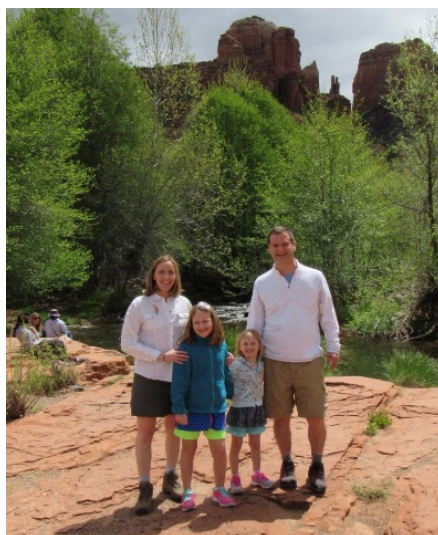
Recent trip to Arizona