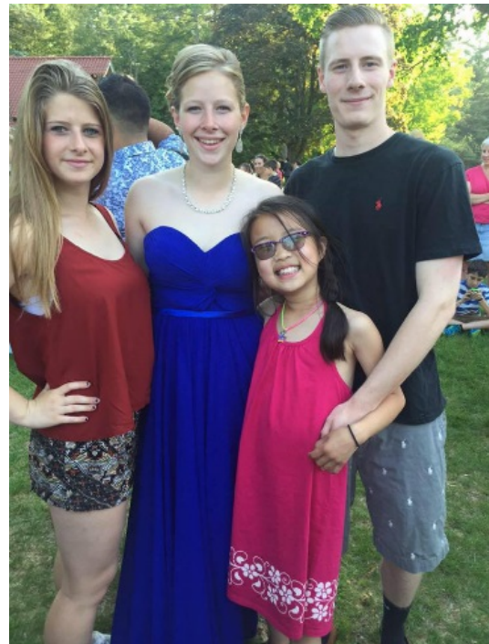
My awesome foursome