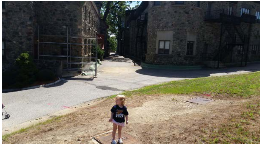
More on campus exploration!