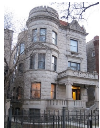
The house...3 years of construction down, one to go!