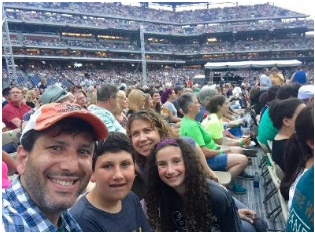
With the family at a concert

My work brings to many cities, and it is always a treat to find old Brandeis friends wherever I land. But Boston remains the HUB -- and I know whenever I touchdown there I will be able to fill a dinner table with great "old" friends. (Sometimes I find an excuse for business in Cambridge just to get back!)