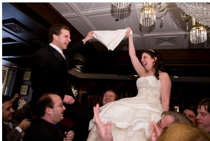
Wedding, March 28, 2009