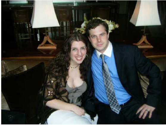
Our 5-Year Anniversary in 2014