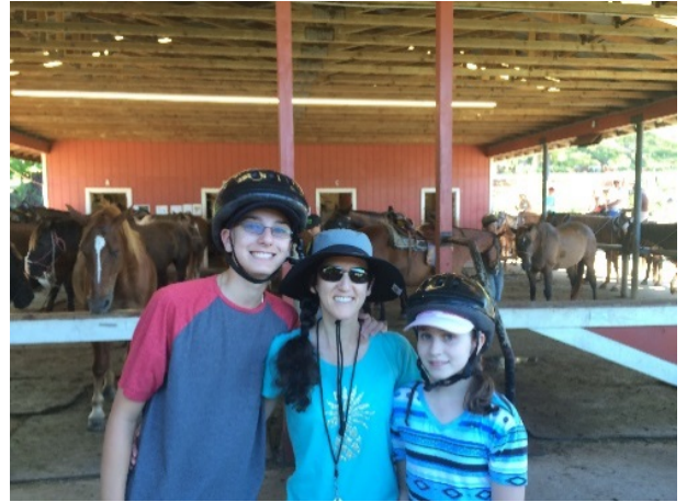
Horseback ride w/ the kiddos in Hawaii -- Summer 2016