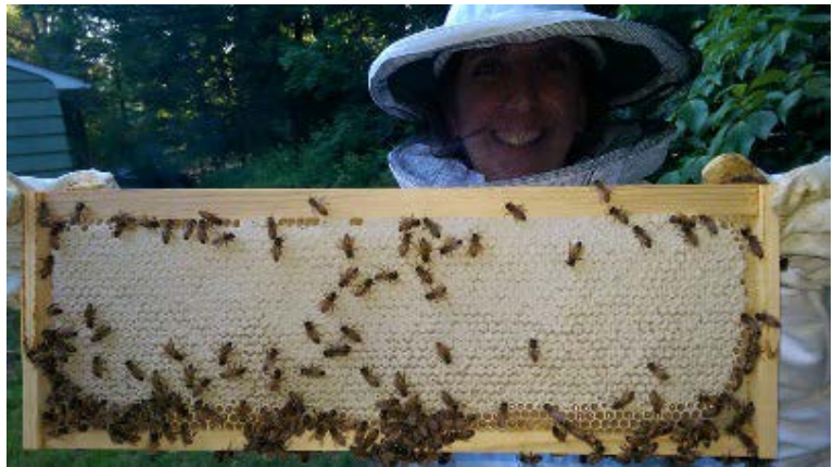
Yes, I'm Really a Beekeeper!