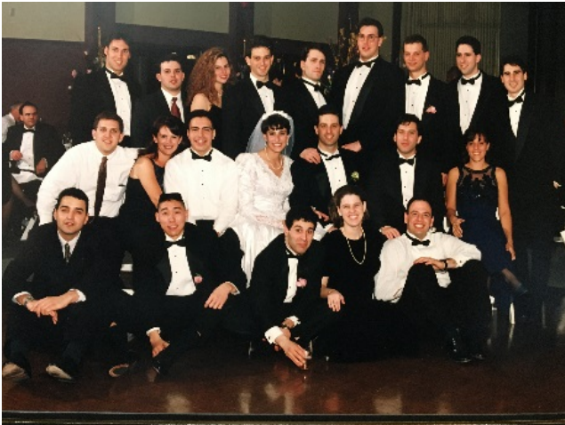
Brandeis friends attending our wedding in 1996, in Columbus, Ohio