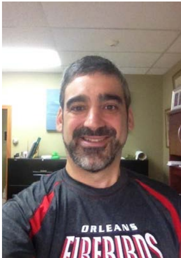
Me in my office

Professor David Hackett Fischer made an incredible impression on me from the first day I met him in person. I took 6 or 7 classes with him and was always amazed at his giant intellect.