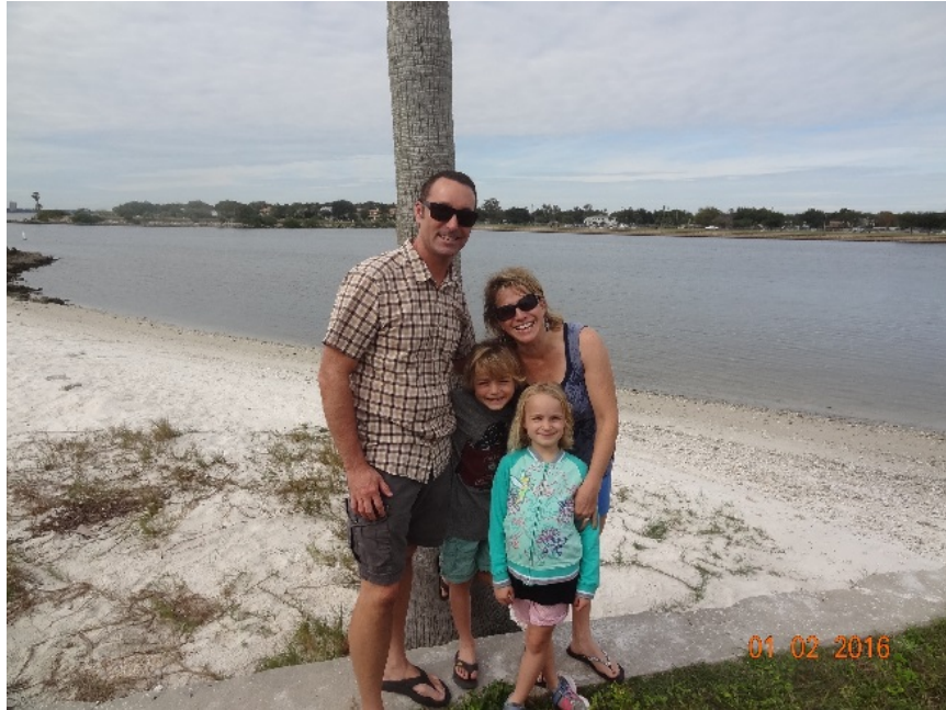
My family in Florida, December 2015