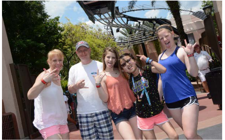
Disney family fun!