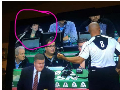
As seen on TV (working a recent Celtics game)