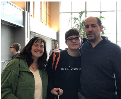
My 14 year old leaving for Italy with his 8th grade class

Take an economic course - they seemed to hard, but more commonly I have to deal with health issues around cost and return on investment