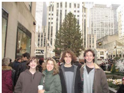
This is the most recent picture of the 4 of us. Taken at Rockefeller Center in December '16.