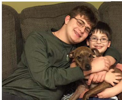
My two sons with our recent puppy, Belle