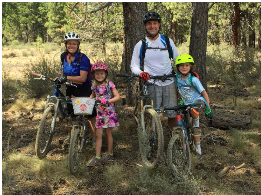
Family bike trip in Bend, Oregon, August 2016