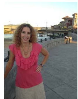
Evening in Napa