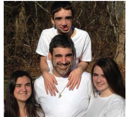
Me with my kids in 2015