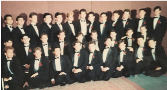
Phi Psi party for getting chartered, 1991