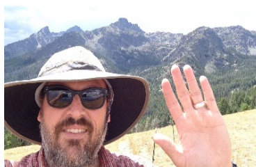
Me at Seven Devils Mtns, Idaho, USA.