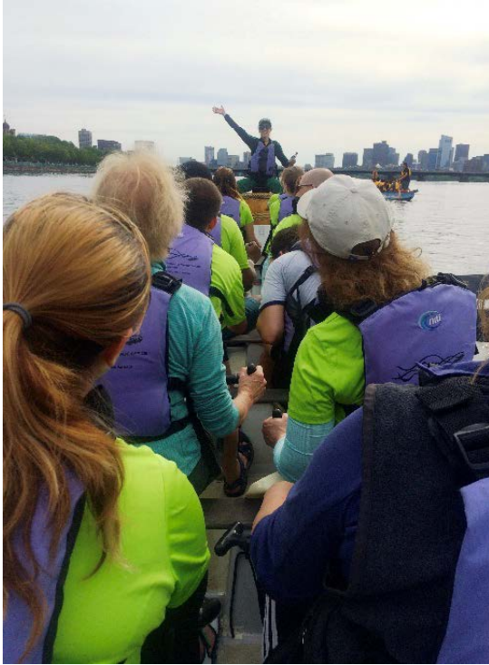
Dragon Boat races 2016 -- Drumming on the Charles River for Lesley University team

Since Brandeis graduation, I've been glad to keep in touch with a few friends, and even though life gets crazy with family and work, and time seems to tight to talk as often as I'd like, whenever we do get together it's like no time has passed at all! I'm grateful to Brandeis for providing the foundation for such special friendships!