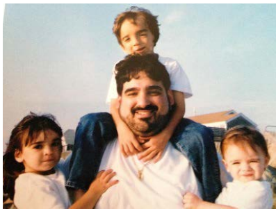
Me with my kids in 2002