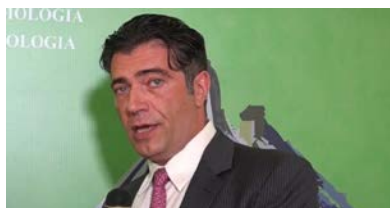
Being interviewed by Eye World Journal