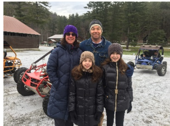
2016 Lake George fun with family