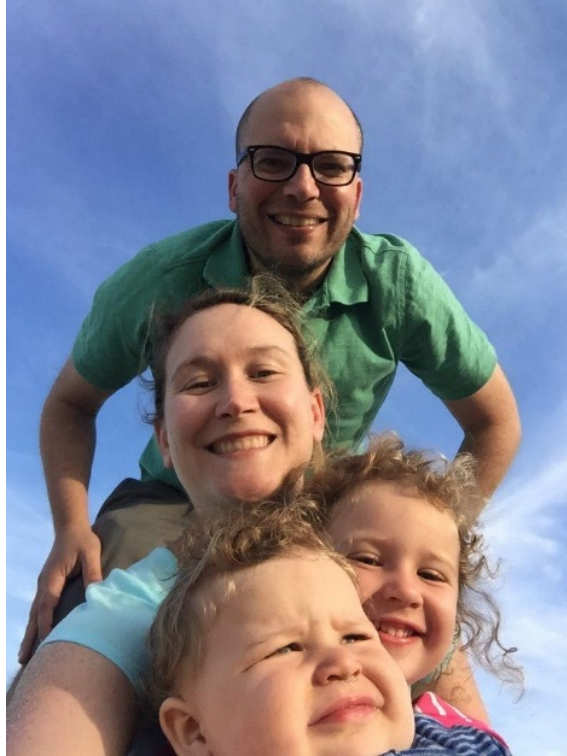
With the family at Narragansett, August 2016