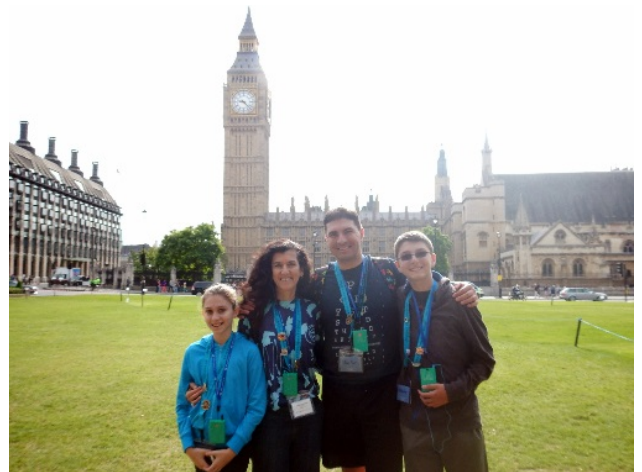
Visiting London in Summer 2015