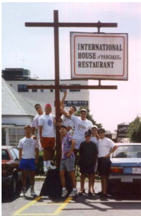
Back in '91 with the guys