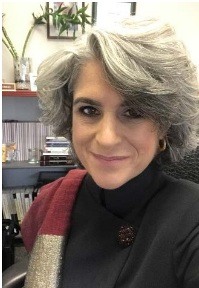
Divorce lawyer by day.

Emory Law, JD 1994; Fellow of the American Academy of Matrimonial Lawyers and International Academy of Family Lawyers; certified by the Supreme Court of New Jersey as a Matrimonial Law attorney. Frequent speaker and author of continuing legal education programs.