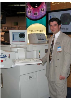
Our laser platform for doing refractive eye surgery.