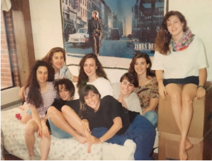
Rosenthal East Suite 210, Sophomore Year '89-'90