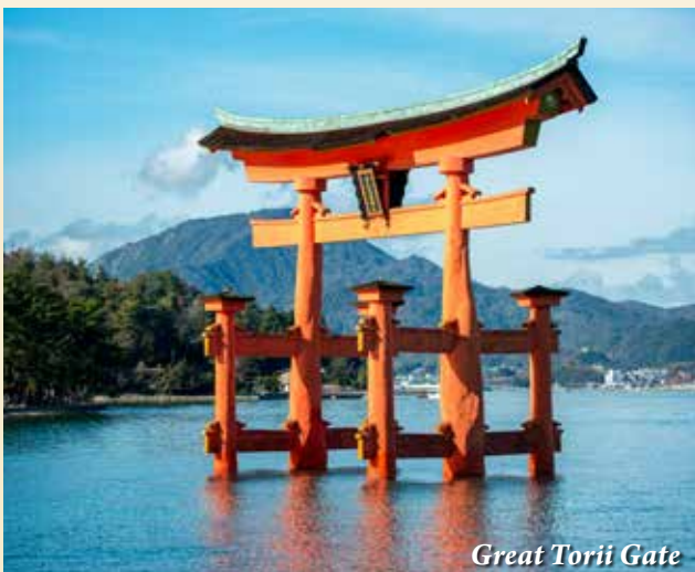
Great Torii Gate